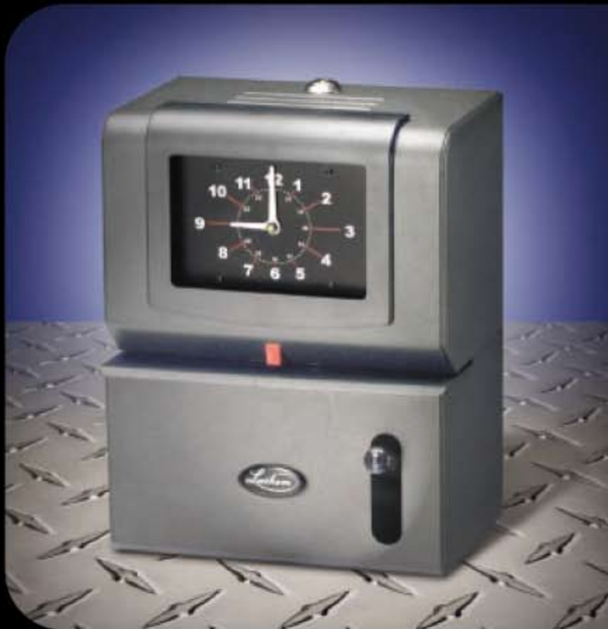
2100 Series (Charcoal Gray)