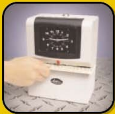
4200 Series (Cool Gray)

Need a steel tough time clock without a tough price? Lathem's mechanical time recorders can't be beat. Ideal for payroll time or job costing, these heavy duty time clocks can withstand high volume use and harsh environments. Whether you choose automatic (4000 Series) or manual (2000 Series) activation, the indestructible coined steel type wheels offer smooth reliable operation and a crisp clear registration every time. Mounted securely to a wall or on a tabletop, the steel case and key lock provide a durable and tamper-proof installation. The two-color ribbon self-reverses at the end of the spool for longer life, and can easily be changed. Works with almost any standard time card.